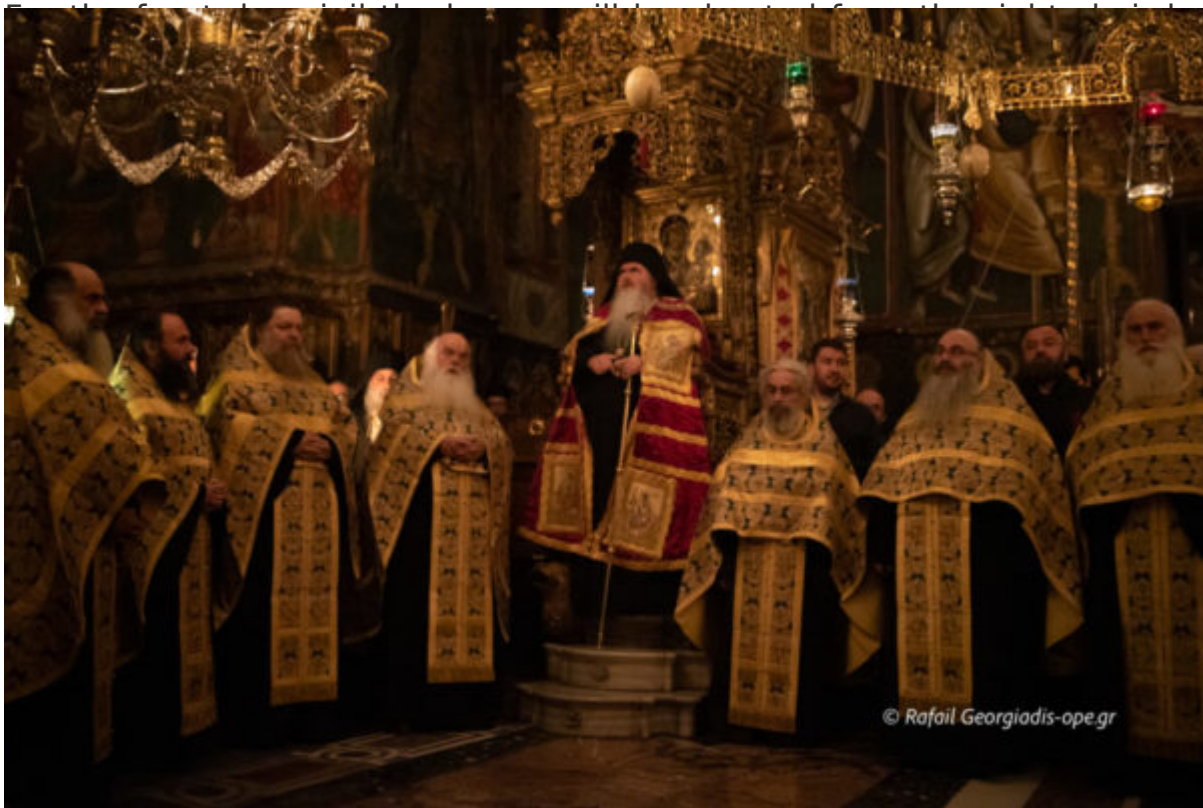
the head di Fathers