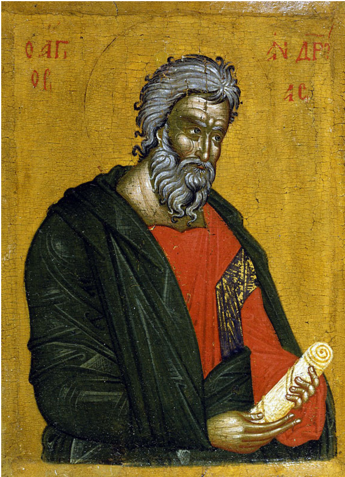
Apostle Andrew, 14th century, tempera on wood, northern macedonia. Now in The Walters Art Museum in Baltimore

The tradition of the saltire in relation to Saint Andrew is of Western origin, from the 12 th /13 th centuries. Because of the translation of his relics to Sicily in the 11 th century, he is considered the protector of the island.