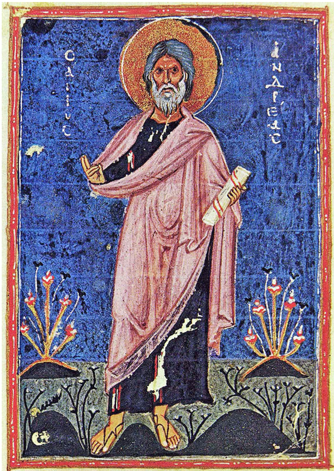
Saint Apostel Andrew, athonite manuscript, 12th Century

Andrew and his brother Peter were disciples of Saint John the Baptist and followed his teachings. It was he who pointed out the Lord to them, saying: "Behold, the Lamb of God". They were so impressed that they followed Jesus; not to become His disciples, but to talk to Him and to acquire personal experience of the Person