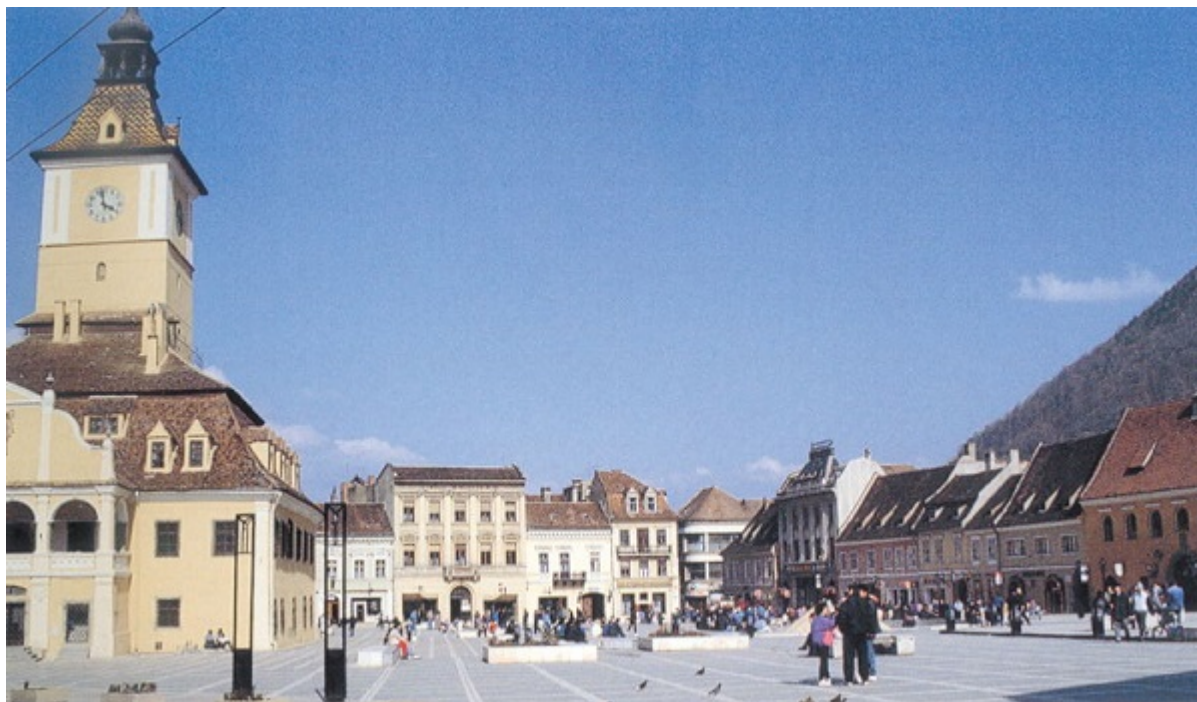
The main square at Braşov, near Father Dumitru Stăniloae's birthplace

The true image of man is Christ. In His person human nature attains its true stature. In this most important work for the first time in contemporary Orthodox theology Father Dumitru developed the ontological dimension of Christology and soteriology, stressing the organic relationship between the person and Christ's work of salvation. 'By becoming a man,' wrote Father Dumitru, 'Christ will always remain with us as a unique source of salvation. Salvation means having a relationship, close contact, with Jesus Christ and not individually striving to abide by a certain set of teachings. Salvation is not, to begin with, a form of knowledge or morality. It cannot be attained by knowing or doing something, but through living a relationship with Christ... Therefore, seeking salvation means seeking Jesus Christ, seeking a relationship with Him.'