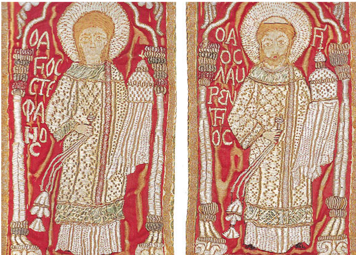
Saint Deacons Stephen and Lawrence. Epitrachelion from Iviron Monastery, Holy Mountain Athos, 17th Century

The first martyr of our faith was the deacon Stephen (Acts 6:8-7:60). After him, there are nearly 100 deacon and deaconess saints mentioned in the Great Horologion. At one time there were 120 deacons and 80 deaconesses at the church of the Holy Wisdom (St. Sophia) in Constantinople. Deacons have been heads of schools, hospitals, orphanages, and other charitable institutions. St. Athanasios was a deacon who was listed in the ranks of those that attended the first ecumenical council that produced our Nicene Creed. Without going into more examples, of which there are many, it should by now be clear that the diaconate was always a part of the life-blood of the “One, Holy, Apostolic and Catholic Faith.”