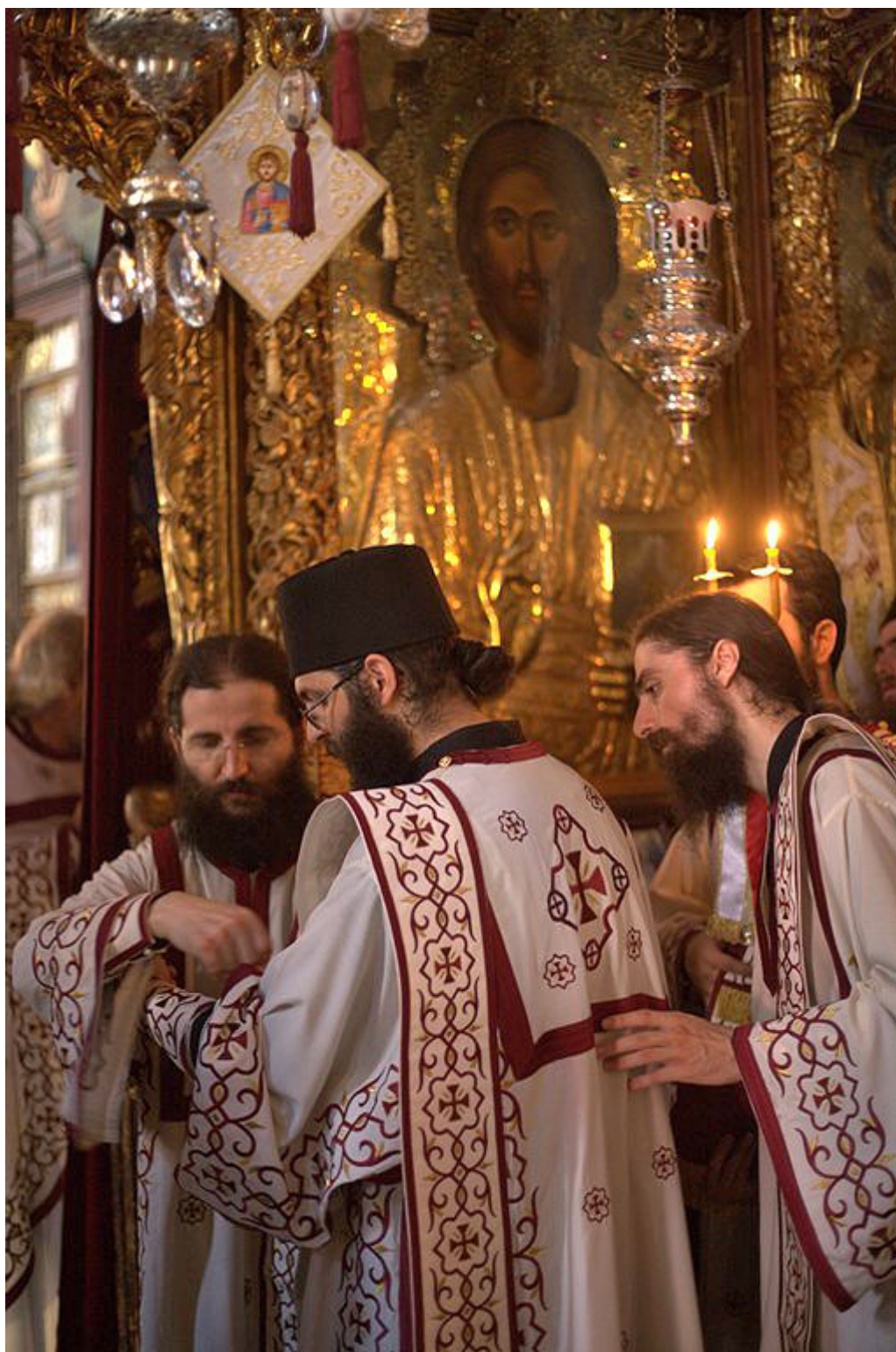
Deacons, Monastery of Vatopedi, 2011

This ministerial human trinity within ancient Israel and the Church obviously reflects the Divine Trinity. In nature, the triangle is the strongest and most stable structure there is. If deacons are missing from our parishes, then what may that forebode for the strength and stability of our Church? The triune ministry of bishop, priest, and deacon also reflects three major archetypes of Christ: Sovereign-king (John 1:49) or high priest (Hebrews 3:1), Shepherd (John 10:11), and Servant