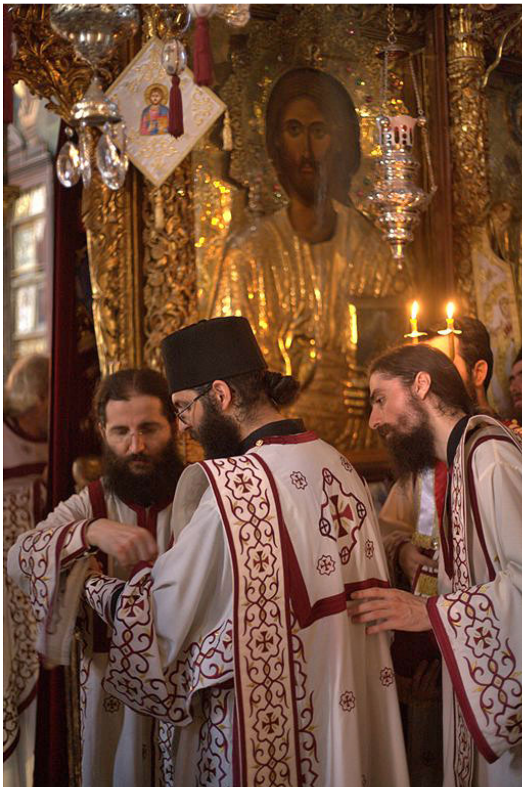
Deacons, Monastery of Vatopedi, 2011

This ministerial human trinity within ancient Israel and the Church obviously reflects the Divine Trinity. In nature, the triangle is the strongest and most stable structure there is. If deacons are missing from our parishes, then what may that forebode for the strength and stability of our Church? The triune ministry of bishop, priest, and deacon also reflects three major archetypes of Christ: Sovereign-king (John 1:49) or high priest (Hebrews 3:1), Shepherd (John 10:11), and Servant