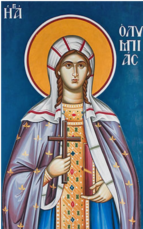
Saint Deaconess Olympia (4th Century). St. John Chrysostom had high regard for Olympia

Historically, this role of care-giver was open to both men and women . Women could be ordained as deaconesses, to serve in a charitable capacity, particular to women or children with special needs, even though deaconesses could not fully serve in the roles of “assistant” or “representative” as delineated above. Unfortunately, deaconesses are even more rare than deacons in the Orthodox Church—in fact, deaconesses may soon be in danger of becoming extinct.