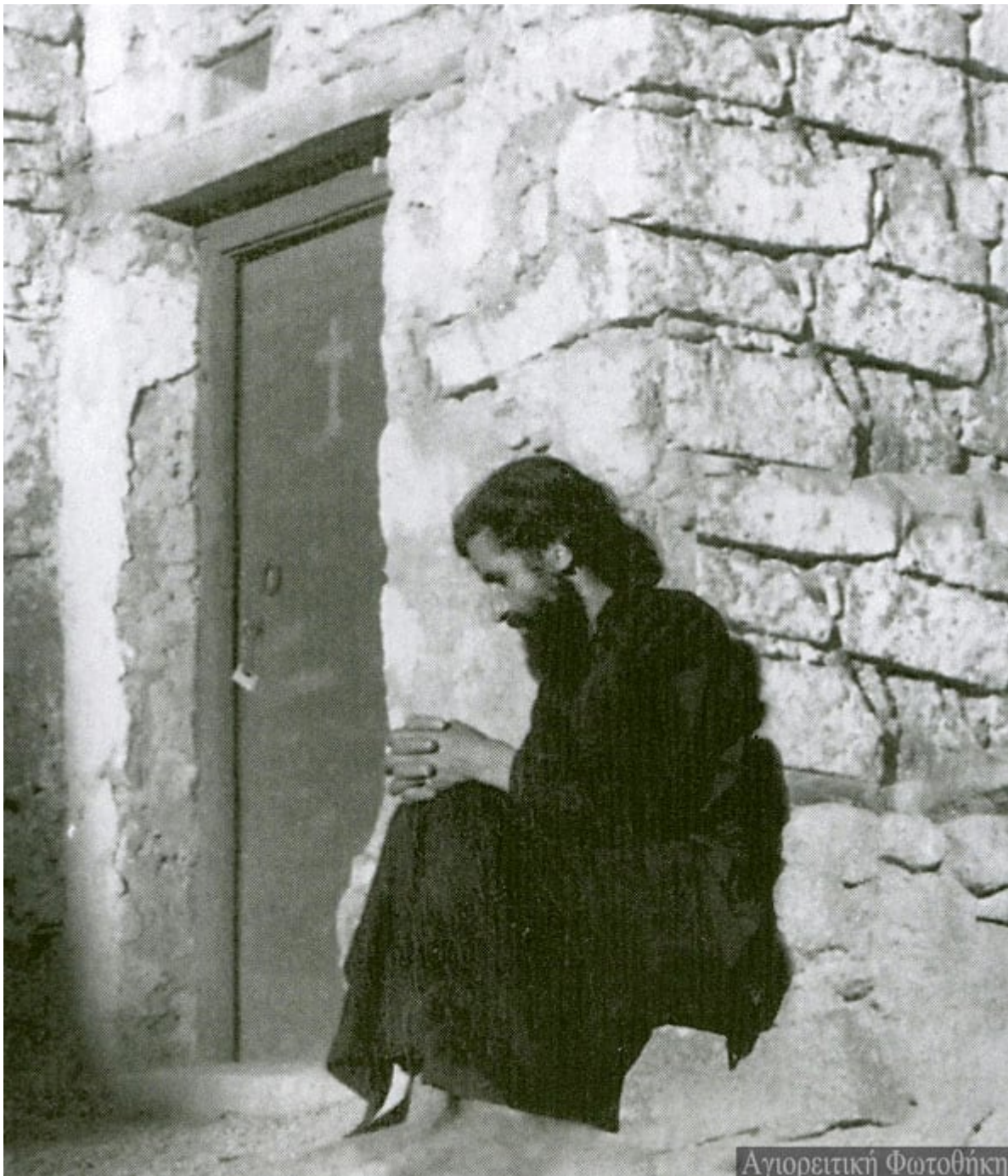
While staying in Mount Sinai