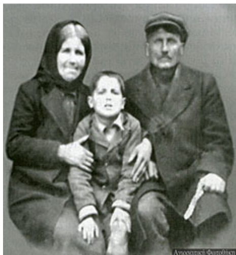
5 years old, with his parents