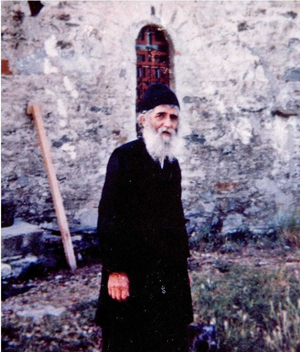
At Kelli Panagouda

I was blessed by God to manage to visit him and talk with him during that blessed and fruit-bearing period of fifteen years that he lived in the Panagouda Cell.