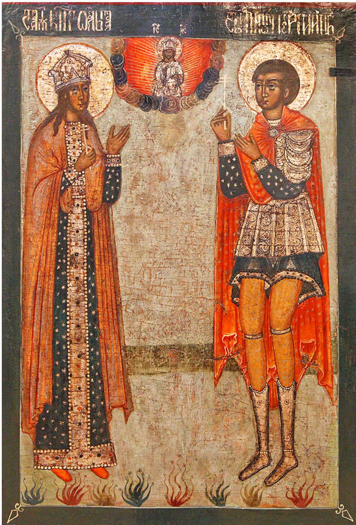
Saint Empress Olga and Saint Martyr George, Icon - Central Russia, 18th Century

When her son took over the reins of the state, Olga lived “for some years in deep peace, enjoying love of her son and people, likewise thanksgiving.” During this time she tried to pass on the evangelical light to her grandchildren, but she didn’t