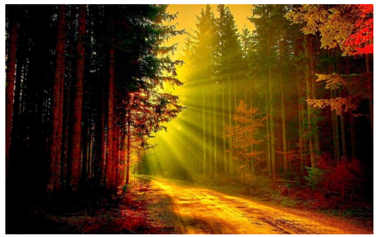
Those who do not encounter inward or outward impediments and who see that